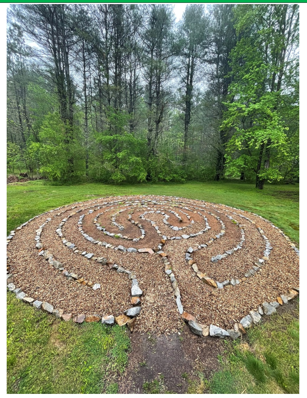
Ancient, old, and new labyrinths exist all over the world today. The Labyrinth Society maintains a searchable database, making it easy for you to find labyrinths close to you. The database can be found here: <a href="https://labyrinthlocator.com/home">https://labyrinthlocator.com/home</a>.

Look for our next newsletter during summer 2021.