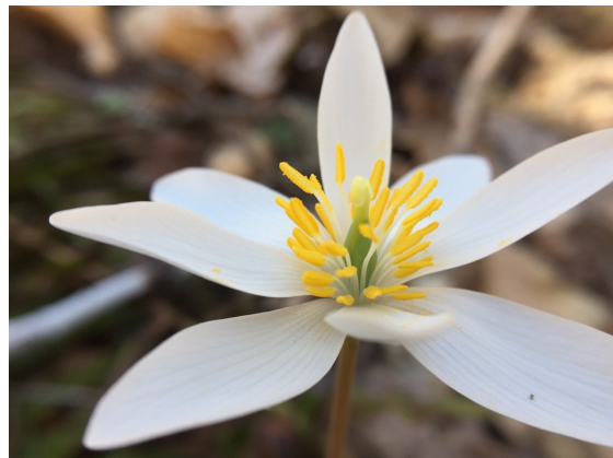
Bloodroot ( Sanguinaria canadensis )