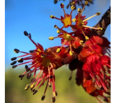
Red maple ( Acer rubrum )

Join N.C. Forest Rangers for a moderate, three-quarter mile hike to observe and identify spring wildflowers! This unique forest ecosystem supports an incredible diversity of plant life, and different wildflowers can be observed each month. Each hike is limited to ten participants and will meet near the main kiosk in the parking area. We recommend bringing comfortable shoes, a water bottle, a camera and a wildflower field guide if you have one.