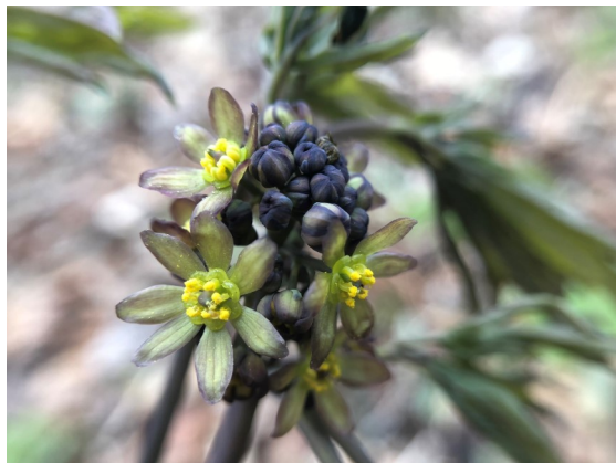
Blue cohosh ( Caulophyllum thalictroides )

These programs are free but you MUST SIGN UP to participate. Call now (828 692-0100) or email holmesesf.ncfs@ncagr.gov to reserve your spot! Each guided hike will only last a few hours, but there is so much more to learn about and explore on your own time at Holmes ESF! We offer hiking trails, picnic areas and a variety of educational exhibits. Category II and III NC EE certification and CEU credit are available for participants upon request.