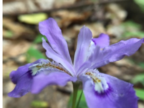
Dwarf crested iris ( Iris cristata )