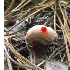
Bleeding tooth ( Hydnellum peckii )

A guided introduction to the world of fungi. Come explore our temperate forest with Ranger Dwigans in search of various fungi. There will be discussion about the history, toxicity, ecology, biology, medicinal uses and edibility of mushrooms that are common to our area, followed by a moderate hike into the forest! You MUST SIGN UP for this program to participate. Call now (828 692-0100) or email holmesef.ncfs@ncagr.gov to reserve your spot! Program is limited to 10 participants. However, additional hikes will be scheduled if there is enough interest. We will meet near the kiosk in the main parking area. It is recommended that you bring comfortable shoes, a water bottle, a camera and a mushroom field guide if you have one. This hike is set to end at 12 p.m., but visitors are encouraged to explore the rest of Holmes ESF on their own time. We offer hiking trails, picnic areas and a variety of educational exhibits. NCEE and CEU credit available upon request.