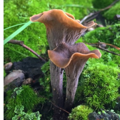
Black trumpet ( Craterellus fallax )