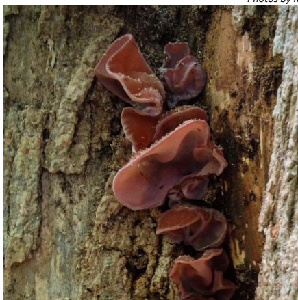
Wood ear ( Auricularia auricula-judae )