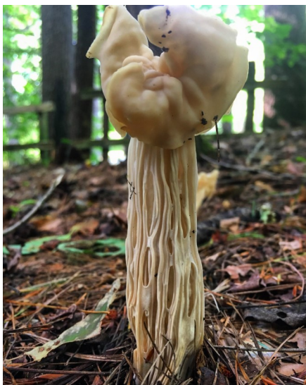
Elfin saddle ( Helvella crispa )