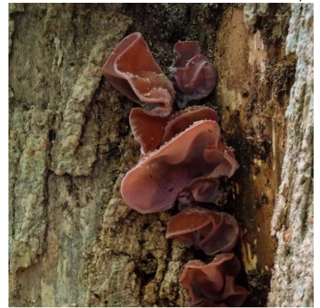
Wood ear (Auricularia auricula-judae )