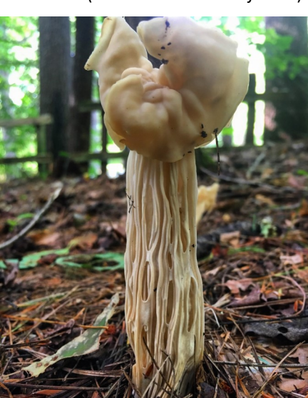
Elfin saddle (Helvella crispa)