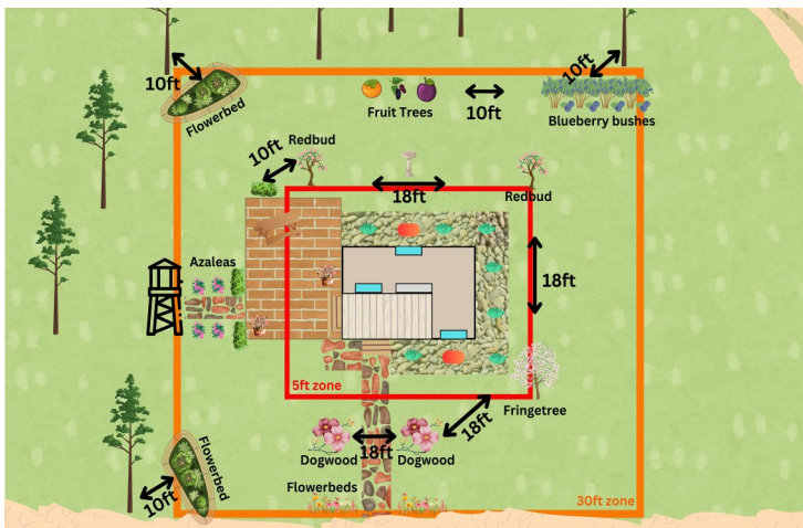
Wildland Urban Interface Defensible Space Model Ranger Station

The bottom image to the left shows the model exhibit plan intended for the defensible space at TCESF based on the home ignition zone guidelines.